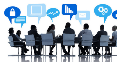
Figure 3: We encourage all of you to participate actively throughout the day!